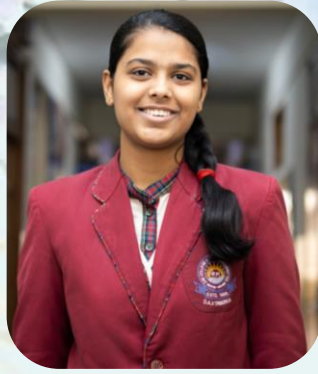
Cheshta 96 %