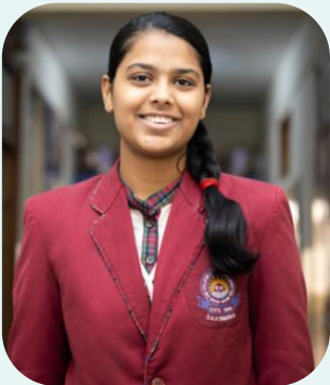
Cheshta 96 %